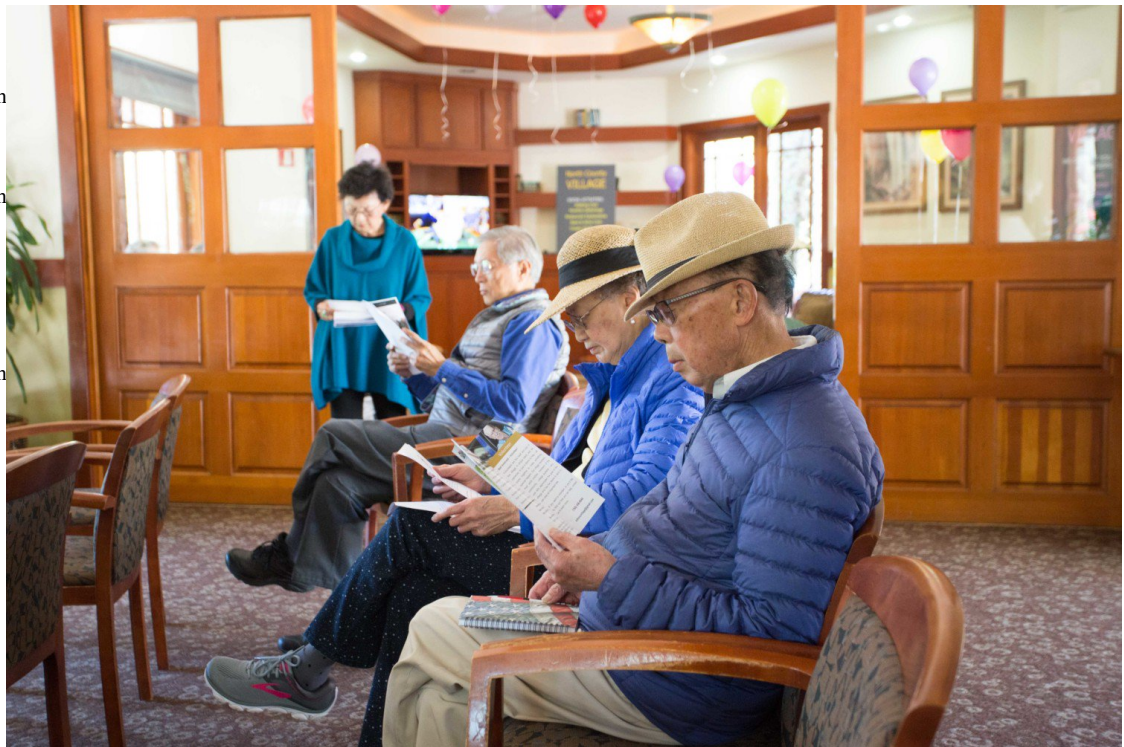
About 100 people attended the North County Village launch party on March 25 at the La Costa Valley Club in Carlsbad.

launches-to-help- local-seniors-stay- connected/#comments)